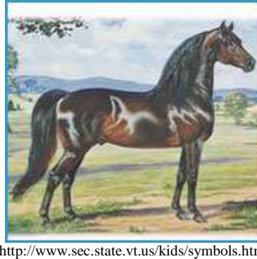
State mammal: Morgan Horse.

http://www.sec.state.vt.us/kids/symbols.html