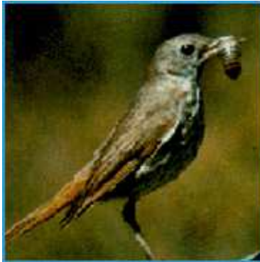
State bird: Hermit thrush

http://www.sec.state.vt.us/kids/symbols.html