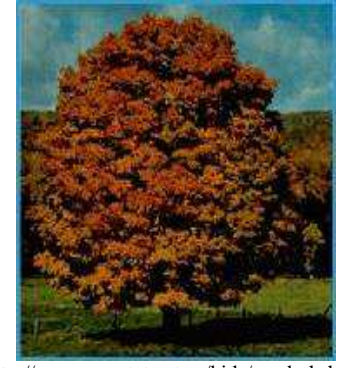
State tree: Sugar Maple

http://www.sec.state.vt.us/kids/symbols.html