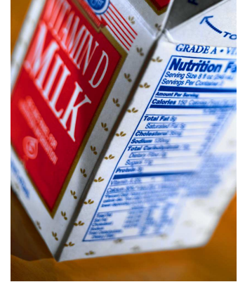
State beverage: Milk

http://www.sec.state.vt.us/kids/images/sye.jpgmbols/