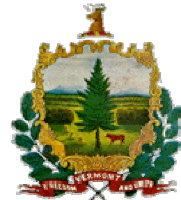
State flavor: Maple

http://www.sec.state.vt.us/kids/symbols.html