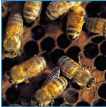
State insect: Honeybee.

http://www.sec.state.vt.us/kids/symbols.html