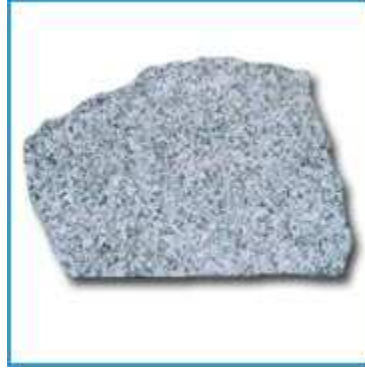
State rocks: granite, marble and slate.

http://www.sec.state.vt.us/kids/symbols.html