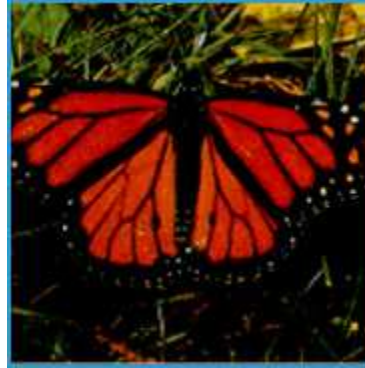
State butterfly: Monarch butterfly.

http://www.sec.state.vt.us/kids/symbols.html