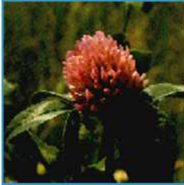
State flower: Red Clover

http://www.sec.state.vt.us/kids/symbols.html