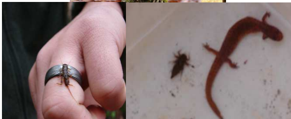
These pictures were taken by an Orchard School fourth grader.